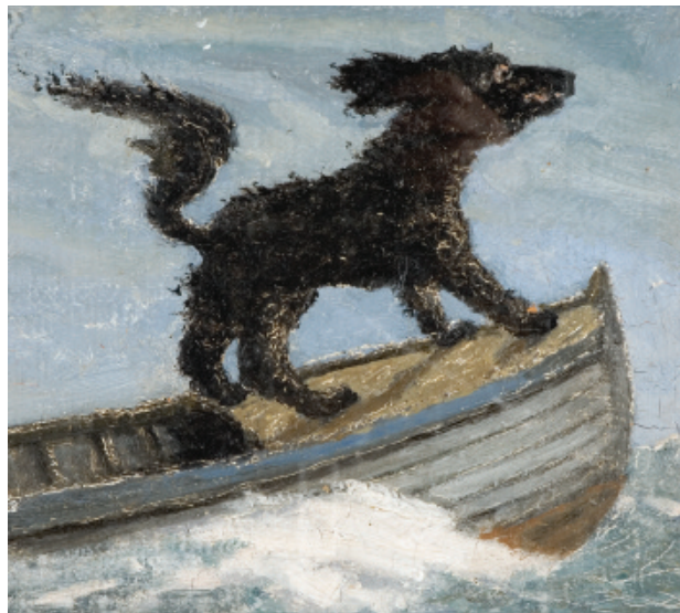
Bobbie Smyth's dog, Poly.