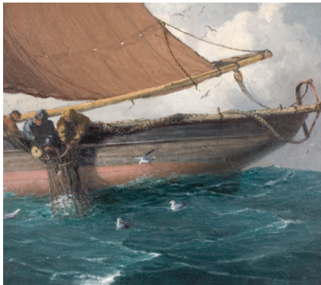
Hauling a Net.